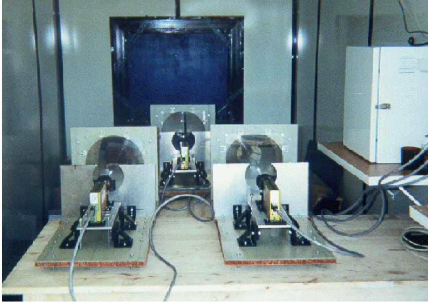
Fig. 1. Three light sources are shown facing the UV transmitting window. The white enclosure (on shelf) contains the solar power regulator and storage battery.

\sim 180^\circ in azimuth, even a fixed direction light beam will allow the aerosol phase function to be measured over most of the range of scattering angles.